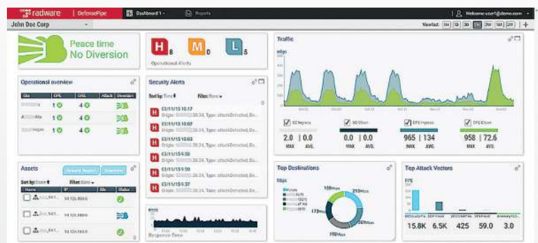
Figure 2: Attack Mitigation Service Portal Dashboard

Radware's Attack Mitigation Service includes active monitoring and health checks on the protected service or application. In addition, the service includes pipe saturation monitoring and customer notification when there is a risk for saturation and action is required.