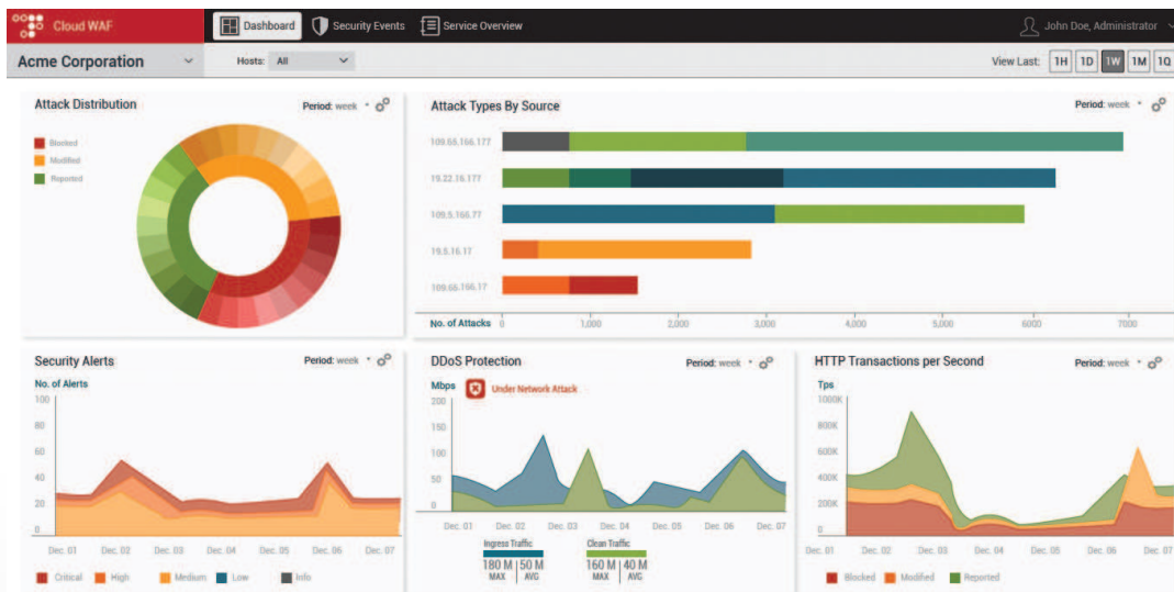
Figure 1: Cloud Security Services Portal Dashboard

Activated through a simple DNS change, with no additional hardware or software installed, Radware's Cloud WAF Service is easily deployed to provide web security coverage in the shortest time-to-deploy.