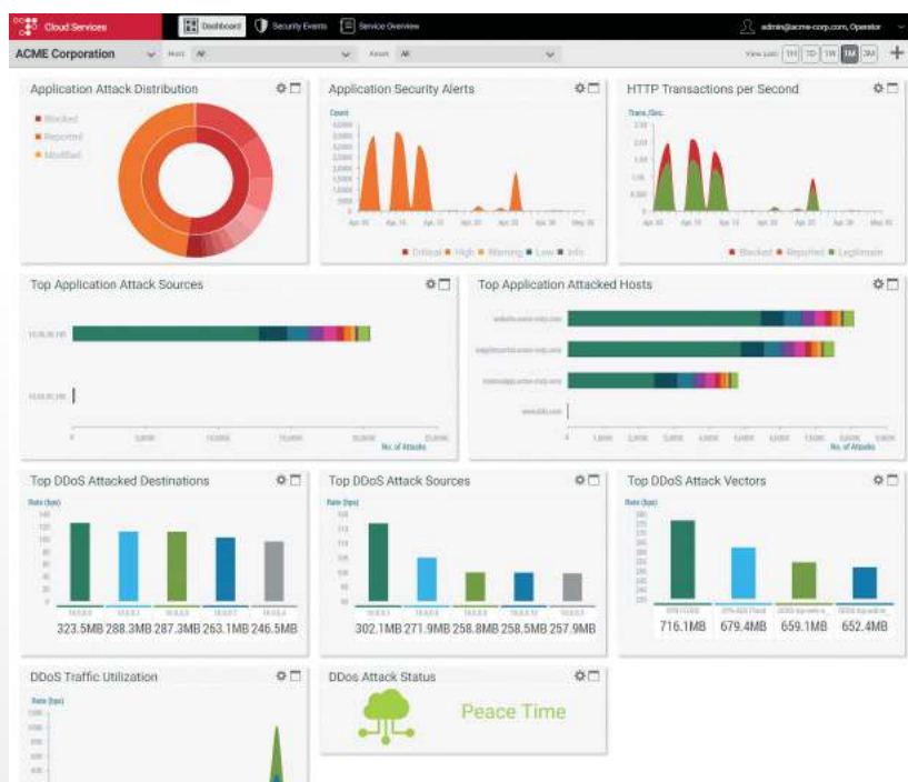
Figure 1: Cloud Security Services Portal Dashboard