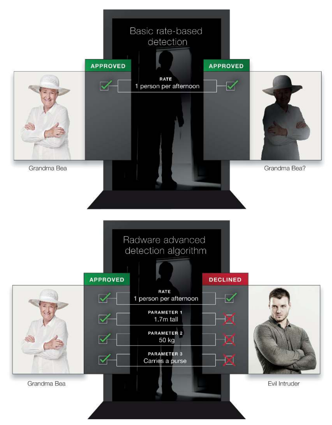
With this approach, Radware generates few false positives. In our example, the grandmother comes to the door and brings several other grandmothers with similar features. Radware identifies this visit correctly as a flash crowd of normal traffic. Five grandmothers with the same "normal' parameters (height, weight, purse) would be correctly identified as a heavy but normal traffic pattern and therefore not an attack. Traditional

Radware sees that the parameters for the attacker do not match the baseline parameters for the grandmother. Radware signals an attack. Traditional solutions, which look only at rate, still identify one person at the door and let the attacker in because no anomalies were detected.